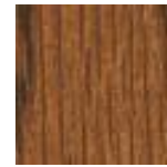
English Oak 788ST-60