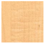
Natural Maple 756-58