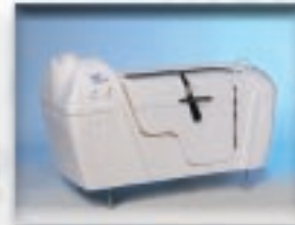
Side Entry Tubs