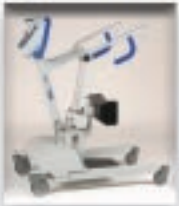
Sit Stand Lifts