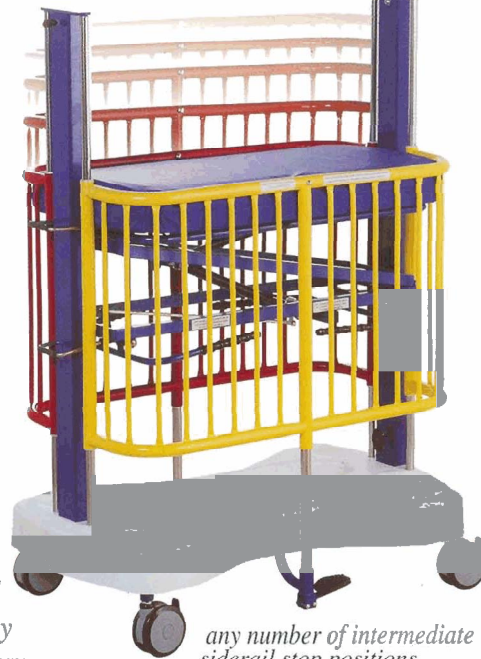
any number of intermediate siderail stop positions

If trendelenburg or reverse trendelenburg is needed – this can be performed at either end of the crib and allows the platform to be set at an any number of height positions to suit every