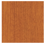
Wild Cherry 5904-43