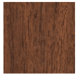
Montana Walnut 7110T-60