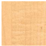
Natural Maple 756-58